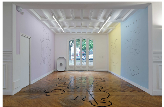
“Disparity and Demand”, group exhibition Curated by Pedro de Llano (2014)