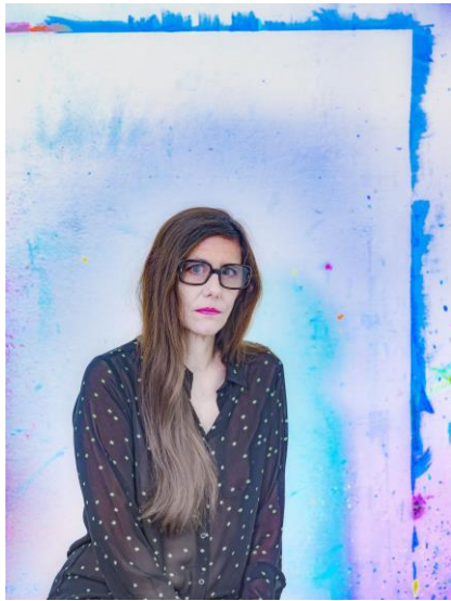
Portrait