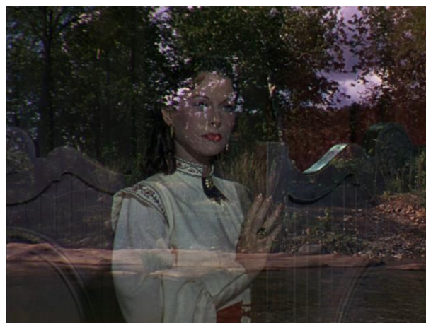
Camille Vivier, Serpent, miroir , 2015 Inkjet print on baryta paper 46,5 x 33,5 cm