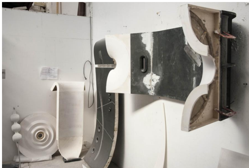
Views of the artist's studio, détails Félix Pinquier, Experiment and Modeling #9 et #18, 2020