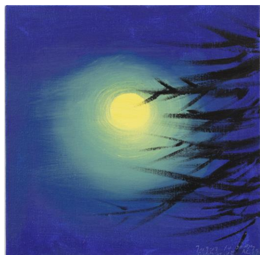
1- Travers Smalley, LandscapeScript (working title) , 2021 Digital image, 5100×6600 px