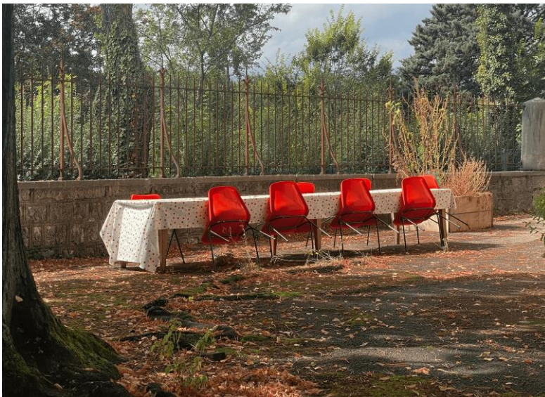
4. Ciné-club with a year eleven visual arts class from Lycée Olympe de Gouges in Noisy-le-Sec at the Cinéma Le Trianon Romainville, Fev. 2023, photo © soto labor