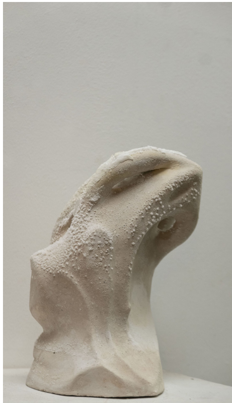
Desobedecio, 2023 Stoneware, salt 30 × 20 × 20 cm Courtesy of the artist © Adagp, 2024