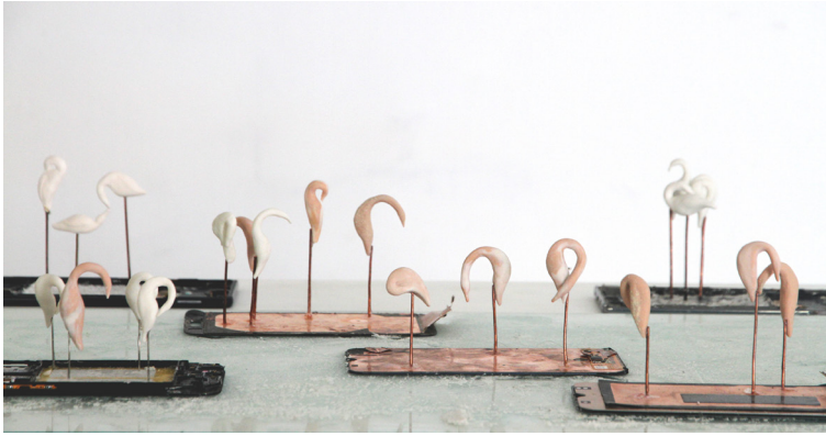
Waiting waders, 2024 Porcelain, copper, salt, recycled LCD screens Variable dimension