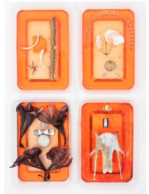
Summer's leftovers, 2022 Mixed technique 16 × 10 × 7 cm each Courtesy of the artist © Adagp, 2024

Press relations: Alyson Onana Zobo alyson.onana-zobo@noisylesec.fr