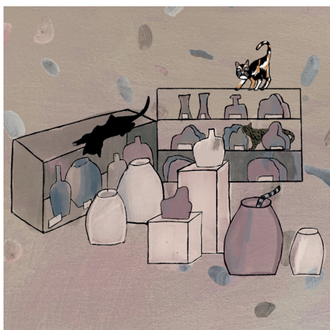
Sophia Balagamwala, A Smart Cats Guide to the National Museum , 2024 Artist's book, 15×15 cm, 32 pages