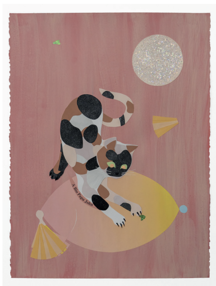
Damir Očko, A Bio Papa John , 2023 Collage, gouache on paper, fabric, glitter, gold leaf, foil 58×76 cm