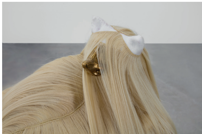
Amber Andrews, A Nose of Gold, A river of hair , 2024 Cotton, synthetic hair, bronze, hair, fosshape and papier-mâché, 100×25×35 cm