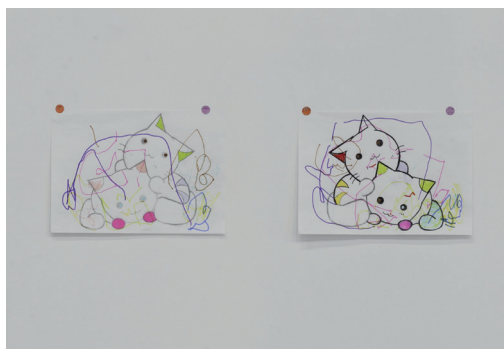
Sarah Tritz, Kawaii (d'après les coloriages d'un enfant prénommé Noël) , 2023 Diptych, drawings in graphite, colored pencil and felt pen 21×29,7 cm each Courtesy of the artist, © Adagp, Paris, 2025 Photo © Ludovic Combe