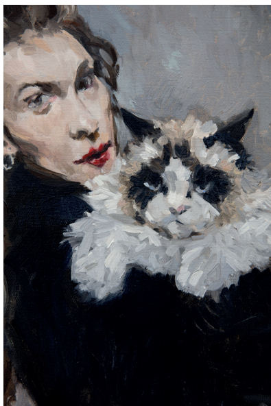
Charles Hascoët, Childless Cat Lady (Taylor Swift) , 2024 Oil on canvas, 46×36 cm Courtesy of the artist, gallery Perrotin, New-York and private collection © Adagp, Paris, 2025